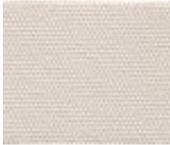
7102 - Eggshell