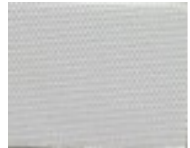
7101 - Frost

Fabric color pictured above can vary from printers. Please see an actual sample piece for true color.