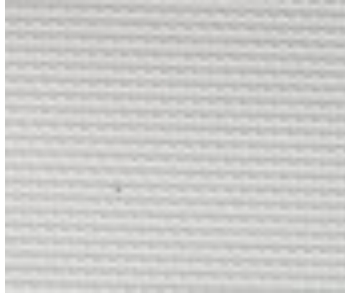
2921 - White