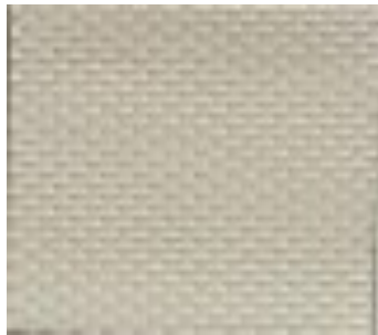
2923 - Fawn