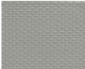
2925 - Grey