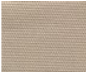
7104 - Buff