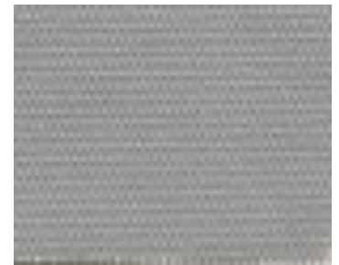
7105 - Earl Gray