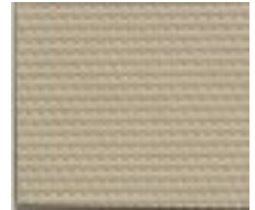
2924 - Champagne