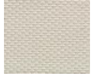
2922 - Linen