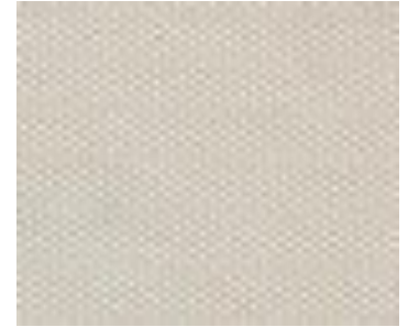
7103 - French Vanilla