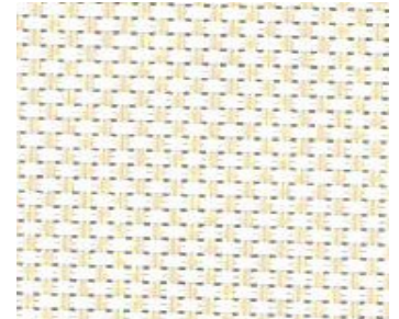
1052 White Linen