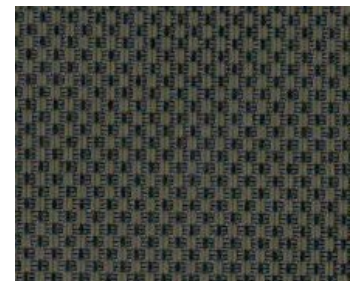
1056 - Brown Chocolate

Fabric color pictured above can vary from printers. Please see an actual sample piece for true color.