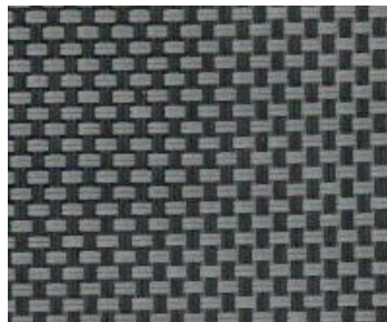
2212 Charcoal Gray