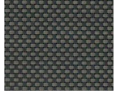
2211 Charcoal Bronze